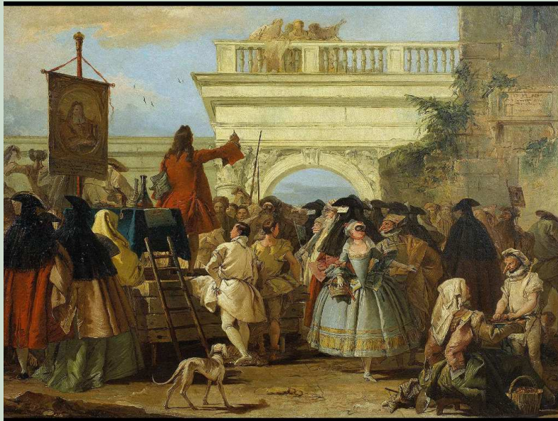
Giovanni Domenico Tiepolo, The Charlatan , 1756

theaters, masked balls, boudoirs, gambling halls and dining rooms he frequented, it provides a survey of important works of 18th-century European art by masters such as Canaletto, Fragonard, Boucher, Houdon and Hogarth, along with exquisite decorative arts objects.