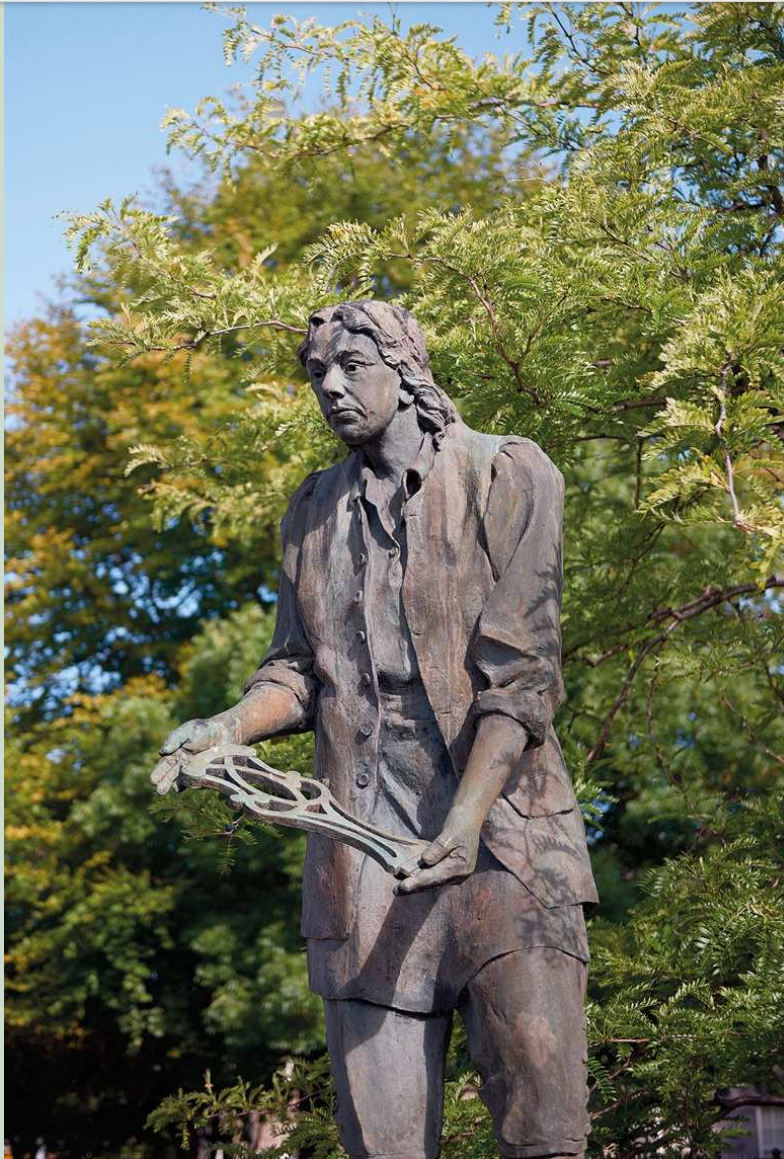
Statue of Thomas Chippendale in Yorkshire

This year we will be celebrating the 300th anniversary of the birth of Thomas Chippendale Senior (1718-1779). "The Shakespeare of English Furniture Makers" is without question Britain's greatest cabinet-maker. His reputation spread far beyond the shores of his homeland, and his genius is reflected in the number of beautifully designed and executed pieces of furniture that survive in excellent condition nearly 250 years after his death.