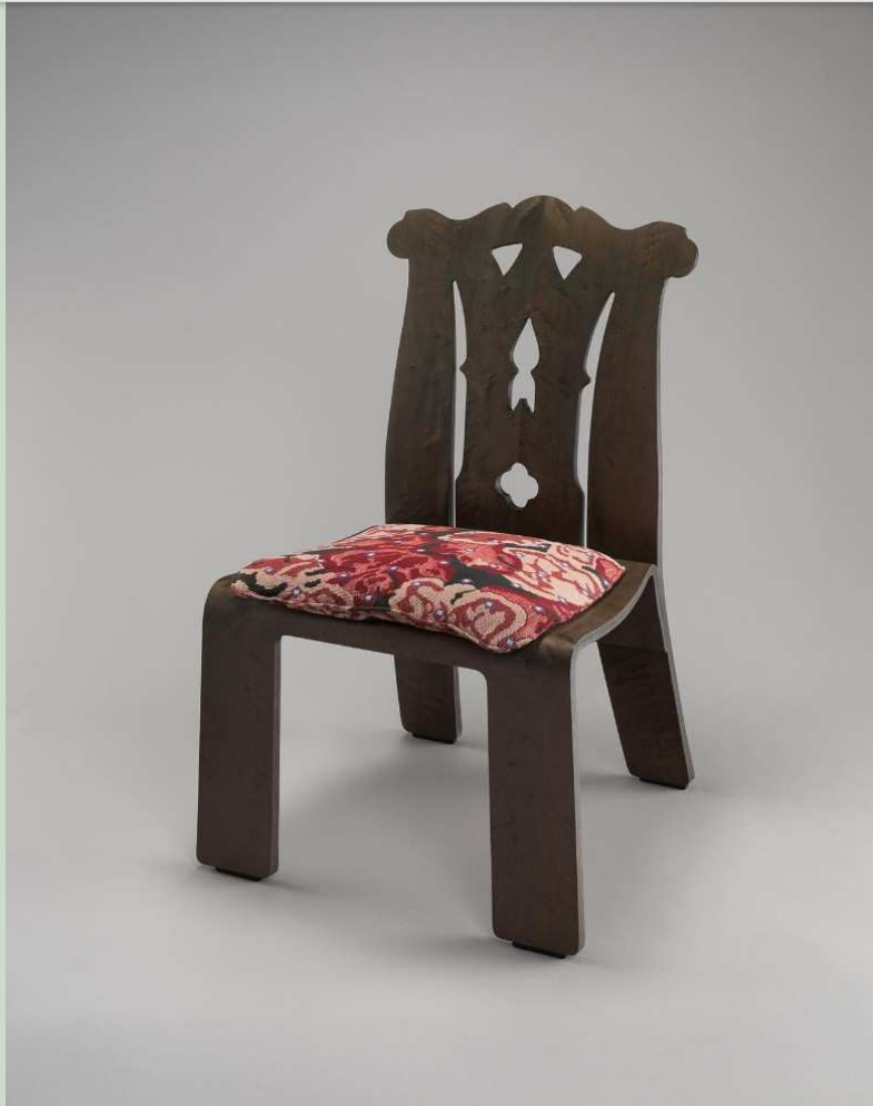
Robert Venturi and Denise Scott Brown's #662 'Chippendale' Chair (1984)