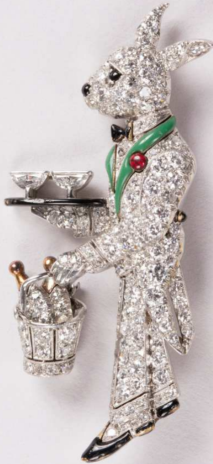
Brooch, ca 1929 Raymond Yard, New York, NY