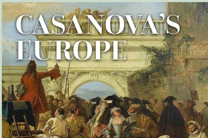
Lunch with Casanova

After the new parking lot is completed, GDAS plans to move back to the Bruce Museum into our usual space from February 2019 through June 2019.