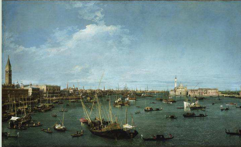
Canaletto (Giovanni Antonio Canal), Bacino di San Marco, Venice , c. 1738

Casanova was much more than the lothario of popular legend. He was one of the most charming, intelligent and magnetic personalities of his day. He traveled throughout Europe mingling with royalty, popes and intellectuals. He wrote one of the wittiest autobiographies known to survive.