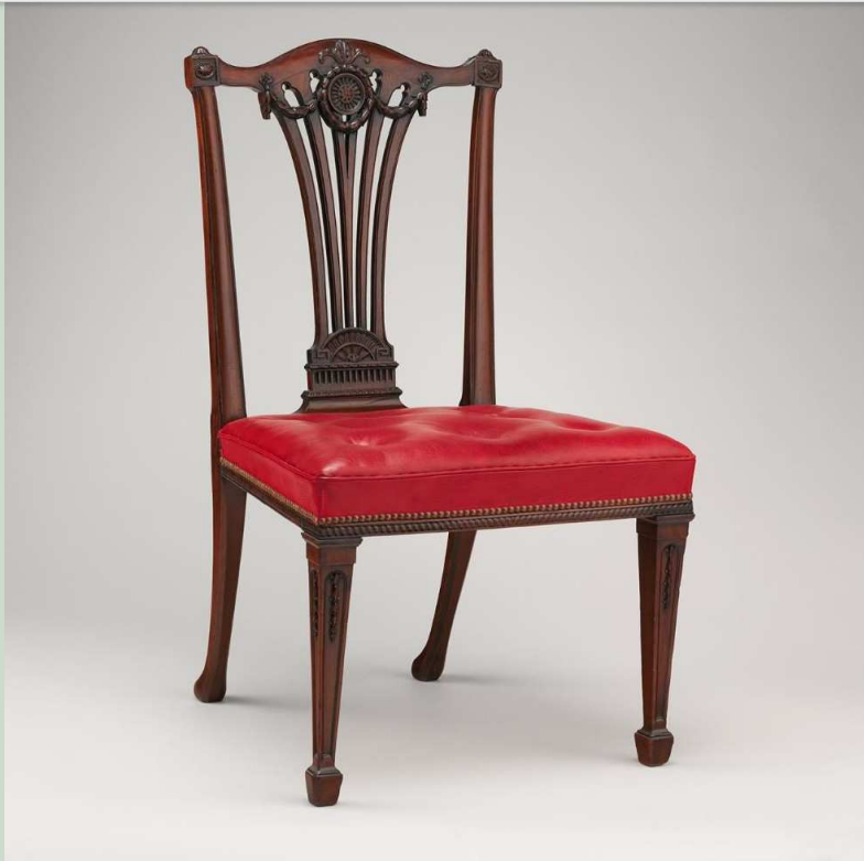
Side chair (from a set of 14) London, England, c. 1772

"One of the show's themes is the new importance accorded to drawing in 18th-century England, where recently established drawing academies were open not just to painters but also to decorative artists like Chippendale...No wonder a palpable sense of curatorial exuberance pervades this show."